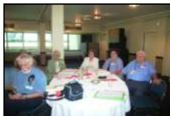
Perth Caboolture and Bundaberg Branches at the AGM