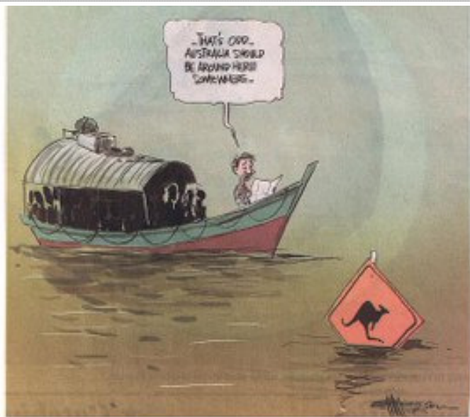
THAT'S ODD, AUSTRALIA SHOULD BE AROUND HERE SOMEWHERE ???

Laurieton Walk will be along the Breakwall / River meeting at car park opposite Sandbar Restaurant—North Haven at 10 am on Monday 28th March.