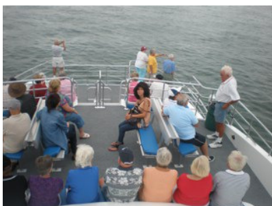
View from the Front Deck of the new Port Venture II Cruise boat.