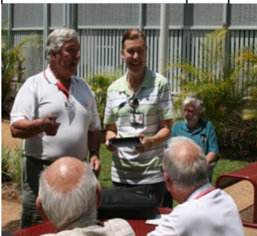
PRESENTATION OF LAPTOP